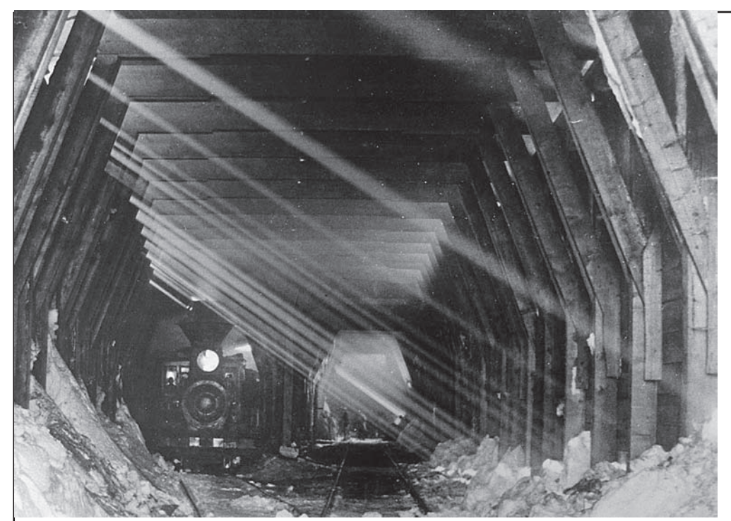
Left: snowshed picture probably by Alfred A. Hart, photographer for the CPRR from the Sugar Bowl collection.

"Through the vents in the roof the interstices between the roof-boards, the sunlight falls in countless narrow bars, pallid as moonshine. Standing in a curve, the effect is precisely that of the interior of some of Gothic cloister or abbey hall, the light streaking through narrow side-windows. The footstep awakes echoes, and the tones of the voice are full and resounding."