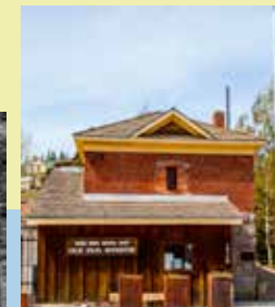
Truckee Donner Historical Society museum at the old jail.