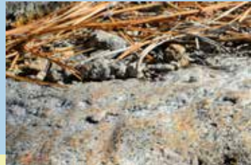
Rust marks and grooves in the granite from emigrant wagons and trains at Big Bend.

20 Mile Museum interpretive signs are all along the route giving the history of the sites, good stories, and things to do.