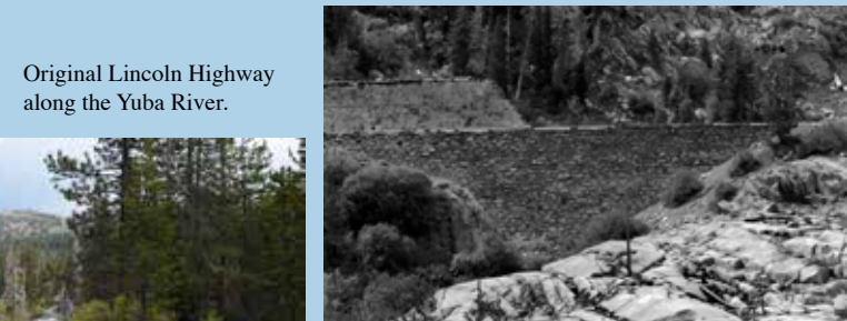
Original Lincoln Highway along the Yuba River.