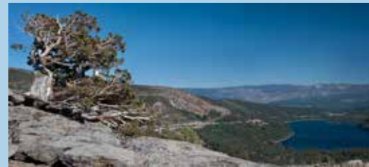
Sierra Junipers, thousands of years old, this one overlooking Donner Lake.