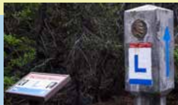
Lincoln Highway marker at Big Bend.