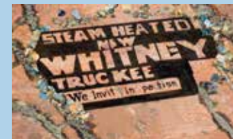
Ads painted on rocks to direct early 20th Century "automobilists."